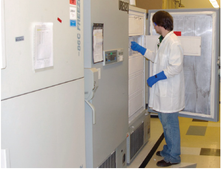
REPROCELL's CLIA certified lab